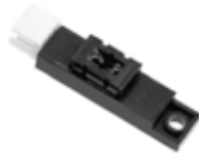
GP2A200LCS0F, GP2A25J0000F, GP2A25NJJ00F